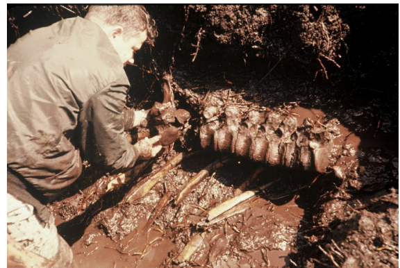
Tualatin's mastodon was dug up in what was a beaver dam swamp on the original land claim, now the site of the parking lot behind Fred Meyer.