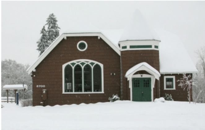
Heritage Center with 16 inches of snow, 12-22-08